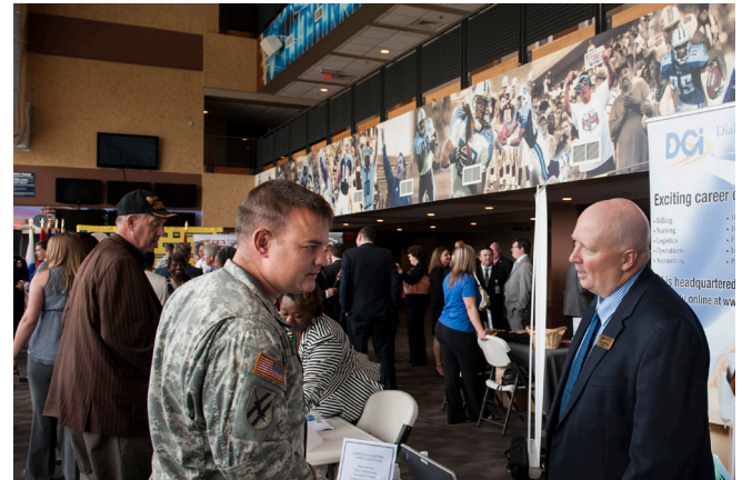
2014 Paychecks for Patriots Hiring Event

The division has Public Relations Specialists that continue to provide employers with additional information through the Workforce Employer Outreach Committees (WEOC). The committees partner with other agencies such as the Governor's Office, Tennessee Department of Economic and Community Development, Tennessee Department of Agriculture, Tennessee Bureau of Investigation, U.S. Department of Homeland Security, FEMA, and the Small Business Administration. The WEOC is an ongoing effort by the Tennessee Department of Labor and Workforce Development to reach out to Tennessee employers and provide valuable information to foster economic development and promote our services.