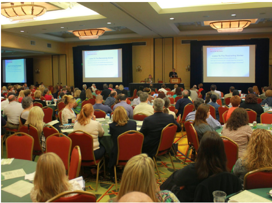
17th Annual Workers' Compensation Education Conference

The Compliance Program is comprised of the Uninsured Employers Fund (UEF) and the Employee Misclassification Education and Enforcement Fund (EMEEF) . The purpose of the UEF is to ensure that Tennessee employers covered by the Act comply with the law's requirement of providing coverage for their employees. The UEF provides an administrative process to investigate and penalize employers that fail to carry required workers' compensation insurance, fail to qualify as self-insured employers, and are not listed on the Tennessee Workers' Compensation Exemption Registry. During FY 13/14, the UEF collected $908,411 in penalties against non-compliant employers. This program's efforts helped ensure that 5,231 employees, otherwise unprotected for workplace injuries, would have access to medical care and disability benefits, if needed. Nearly 900 onsite inspections were conducted, and 291 employers became compliant with the law due to this program's efforts.