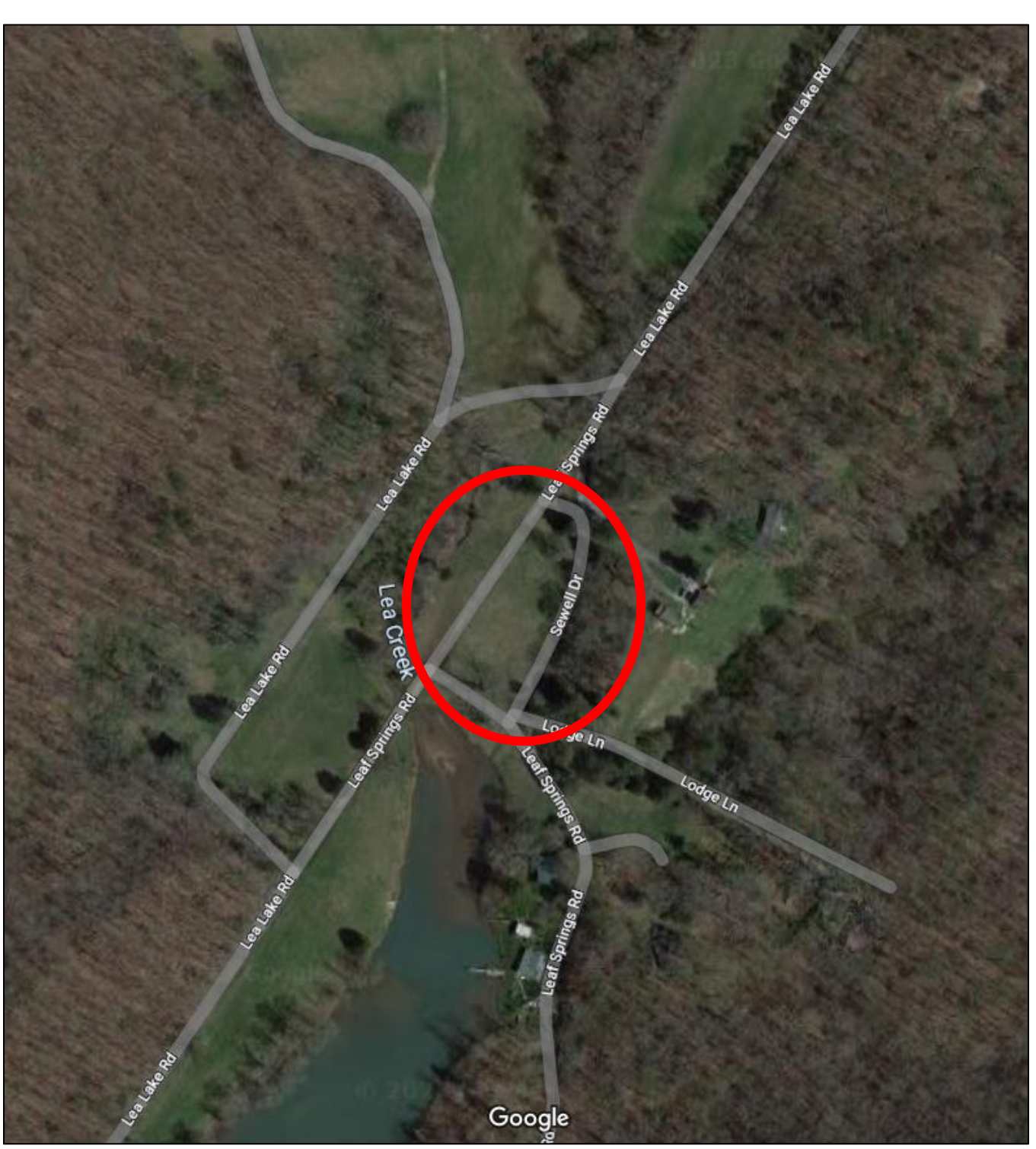
Figure 3: Vacant Lea Springs site (circled in red), 2023.

Lea Springs Name of Property Grainger County, Tennessee County and State 75001754 NR Reference Number