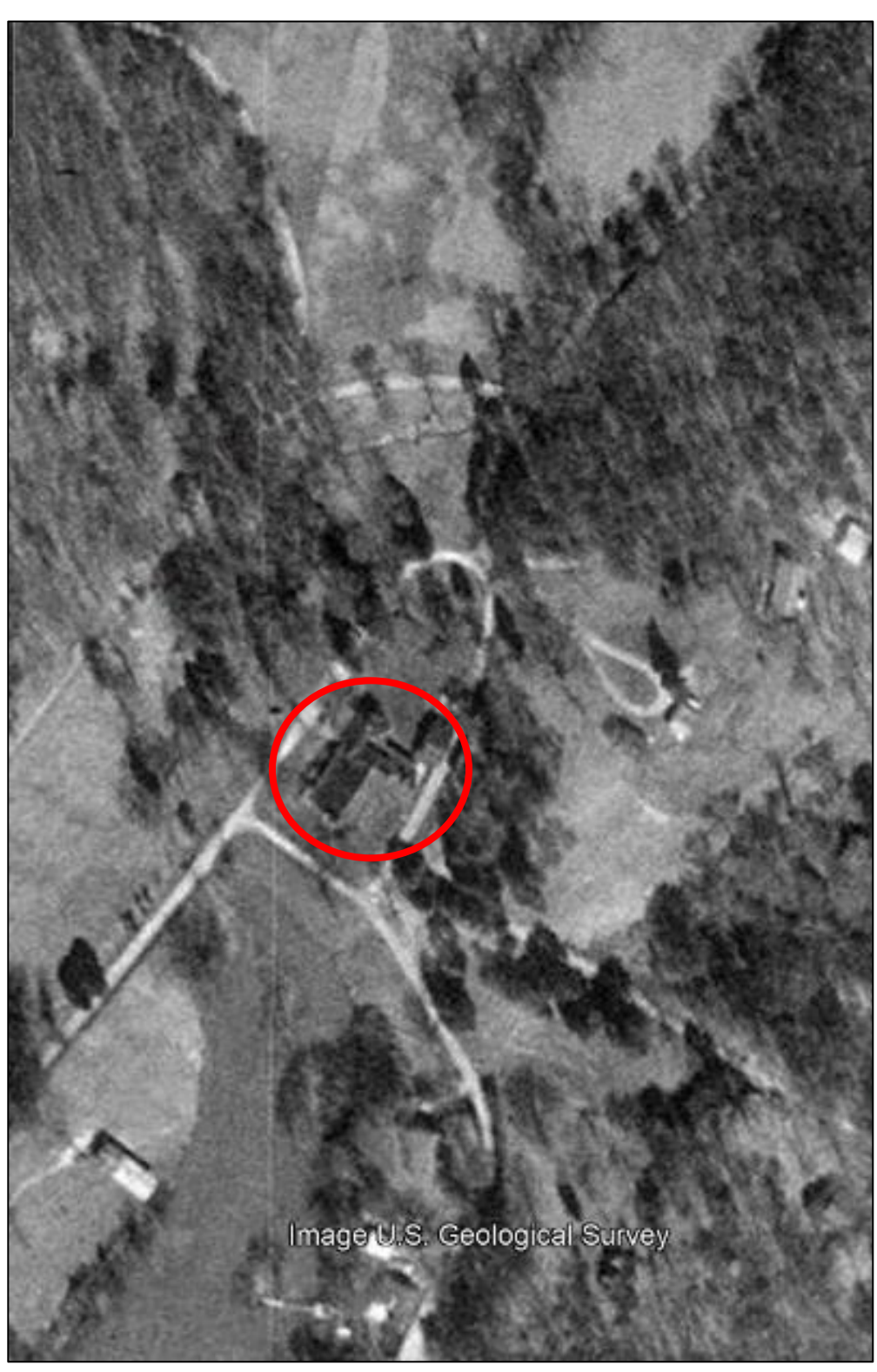
Figure 2: Aerial View of Lea Springs (circled in red), 1997.

Lea Springs Name of Property Grainger County, Tennessee County and State 75001754 NR Reference Number