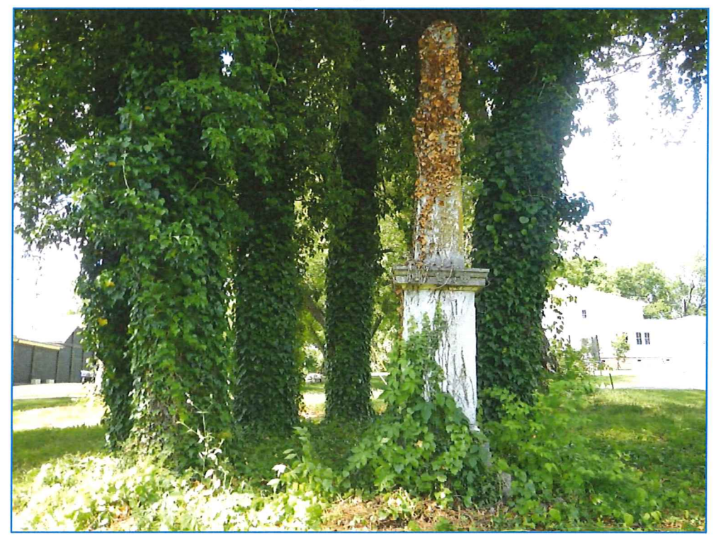
Figure 2.The Sarah Mayfield monument and the heart of the cemetery. Figure 3. Map of the Mayfield Cemetery