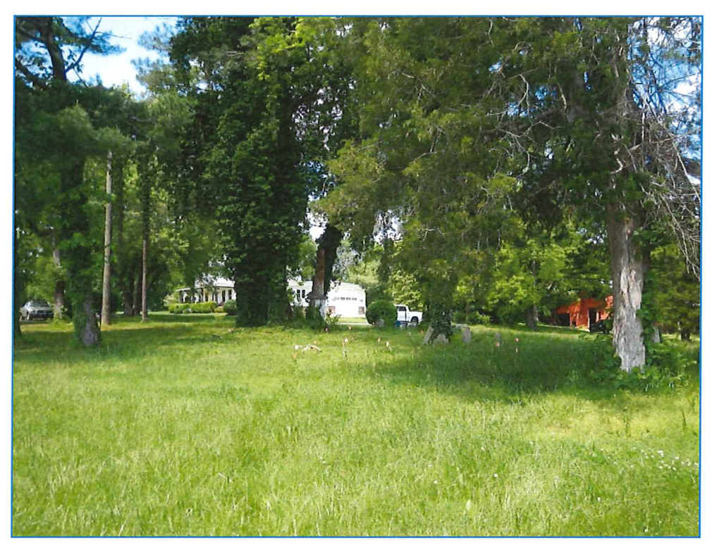
Figure 1. View of the Mayfield Cemetery after the burial depression were marked around the site, facing north.