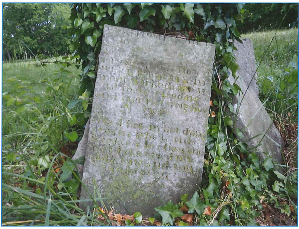
Figure 7. Headstones stacked against tree.