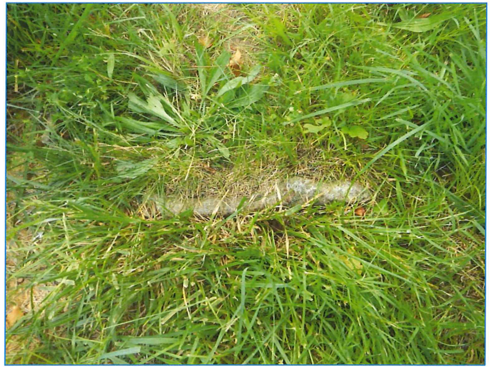
• Grave marker with inscription. Aged 15, four our light affliction which is but for a moment