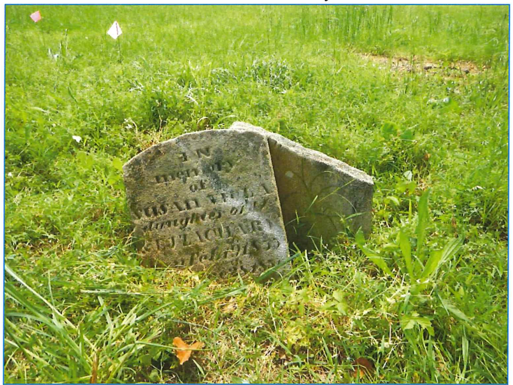
Figure 6. Tombstone with inscription, In memory of Susan Wila? Daughter of Zachary born Feb 19, 1853 died / 25, 185?.