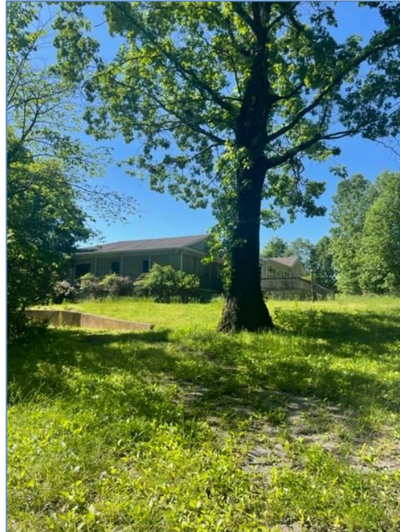
Figure 2. House and Gravel Drive northeast of John Garrett Cemetery.