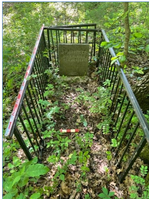
Figure 3. John Garrett Cemetery.