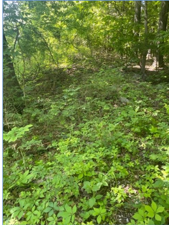
Figure 4. Push pile directly west of John Garrett Cemetery.