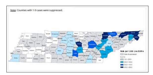
Figure 2: Rate of NAS Cases by County, 2019

• The high percentage of infants diagnosed with NAS with exposure to prescribed medications highlights the need for primary prevention of NAS. Primary prevention includes preventing substance misuse/abuse among women of childbearing age and assessing the reproductive goals (using a client-centered approach) of women at risk of misusing/abusing substances (see PREGNANCY PLANNING section).