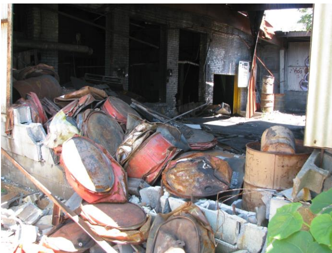
Brownfields can have many unsightly characteristics, such as drums and graffiti as shown in this photo.

The Phase II site assessment is designed to evaluate the degree of contamination and health or environmental risk posed by exposure to such contamination. It may not provide sufficient information to estimate the exact quantity of wastes to be addressed or the costs of cleanup. Additional work may be needed which is discussed in Step 3, "Cleaning up your Site."