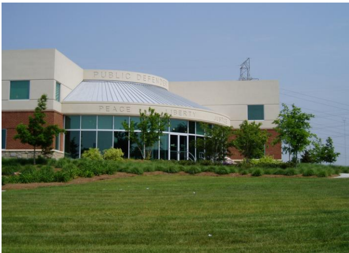
The Peace and Justice Center is home to the Public Defenders office in Knoxville, TN. It is located on a portion of the former Foote Mineral facility.

Now that you have resolved the initial challenges associated with the environmental aspects of the site, you can turn your attention to the final steps. You may be marketing your now-clean property, trying to ensure a good return on your investment, and doing your best to attract the right developer. You will be facing the challenges inherent in any development project, such as providing appropriate infrastructure, but you also need to convince future buyers and occupants that the site is safe for their use.