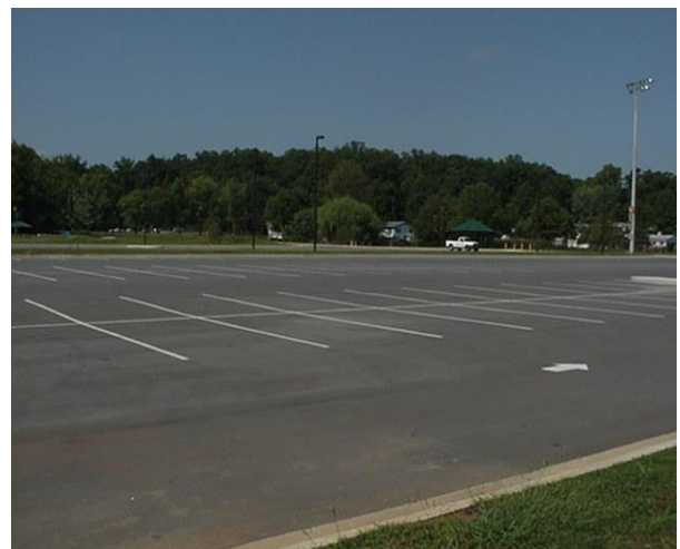
An end use for a Brownfield could be a parking lot, where the parking lot is used as a cap.