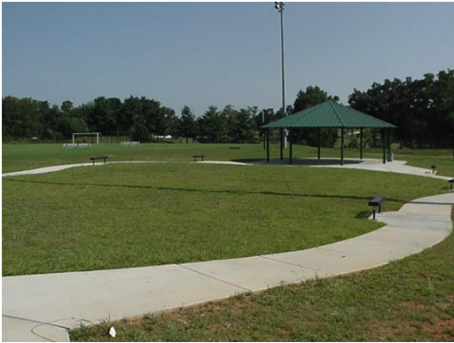
A former landfill was converted to a park and soccer complex.

The type of cleanup required at a Brownfields site depends on a number of factors. These factors include location, type and amount of contaminant(s) present, how widespread and deep the contamination is and the intended future use.