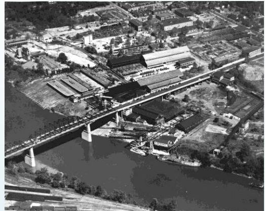
Finding out the history of an area is an important part of a Phase I Assessment. This is a photo of the downtown Nashville Riverfront in 1947.

No. Information from older Phase I reports may be used as a resource, but the 2002 Federal Brownfields Act requires that a Phase I assessment used to meet the requirements of AAI must be completed within a year prior to taking ownership of the property. This is to ensure that the current environmental status of the property is known at the time the property is transferred. In addition, certain aspects of the AAI assessment must be completed within 180 days prior to the property transfer (i.e., on-site investigation, records search, interviews, and search for environmental cleanup liens). This protects the buyer from inadvertently accepting