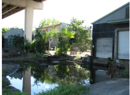
Sometimes Brownfields sites can also have public health and safety hazards.

A Phase II environmental site assessment is a detailed evaluation of environmental conditions at a property. This evaluation relies on the collection and analysis of soil, sediment, soil vapor and groundwater samples, and other measurements taken at the site to confirm and quantify the presence of environmental contamination at the property. Before and after conducting the sampling activity, it may be appropriate to involve TDEC to comment on the relevance and adequacy of the effort.