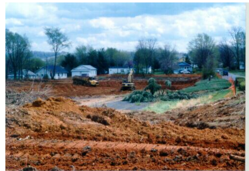
This is a former land fill that was capped by the city of Johnson City for a state of the art soccer complex.

The results of your Phase II assessment may indicate that contamination on the property exceeds state and/or federal screening or cleanup standards. Cleanup may be necessary to either prevent exposure by future users of the site to contamination or to stop a release of contamination into the environment. This Step is intended to provide general information on cleanup and its role in the Brownfields redevelopment process.