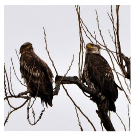
Top to bottom: Reelfoot Lake Cypress; Bald Eagles (juvenile & adult)/next page: Blackburnian Warbler

Reelfoot Lake and its associated habitats are internationally wildlife diversity, scenery, and recreational opportunities