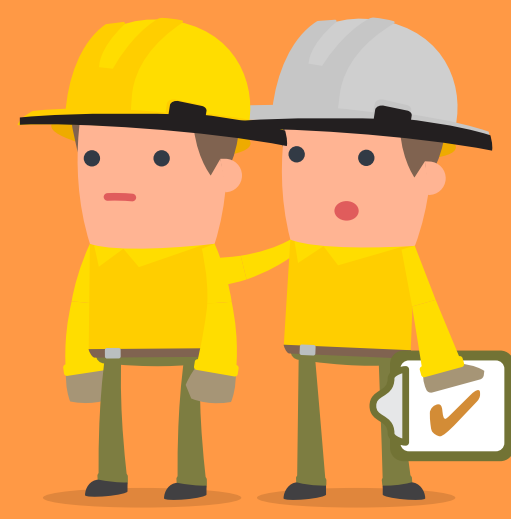
Crew Safety Briefing