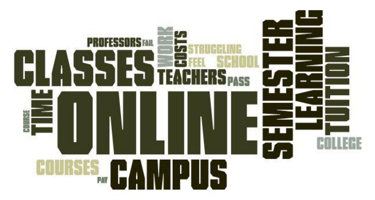
Figure 3. Word cloud of open-ended survey responses to the question, "Based on your situation, what could your college do to better support you?"

In general, students indicated a need to improve their online/distance education experience. This was consistently referenced as the greatest need for improvement across