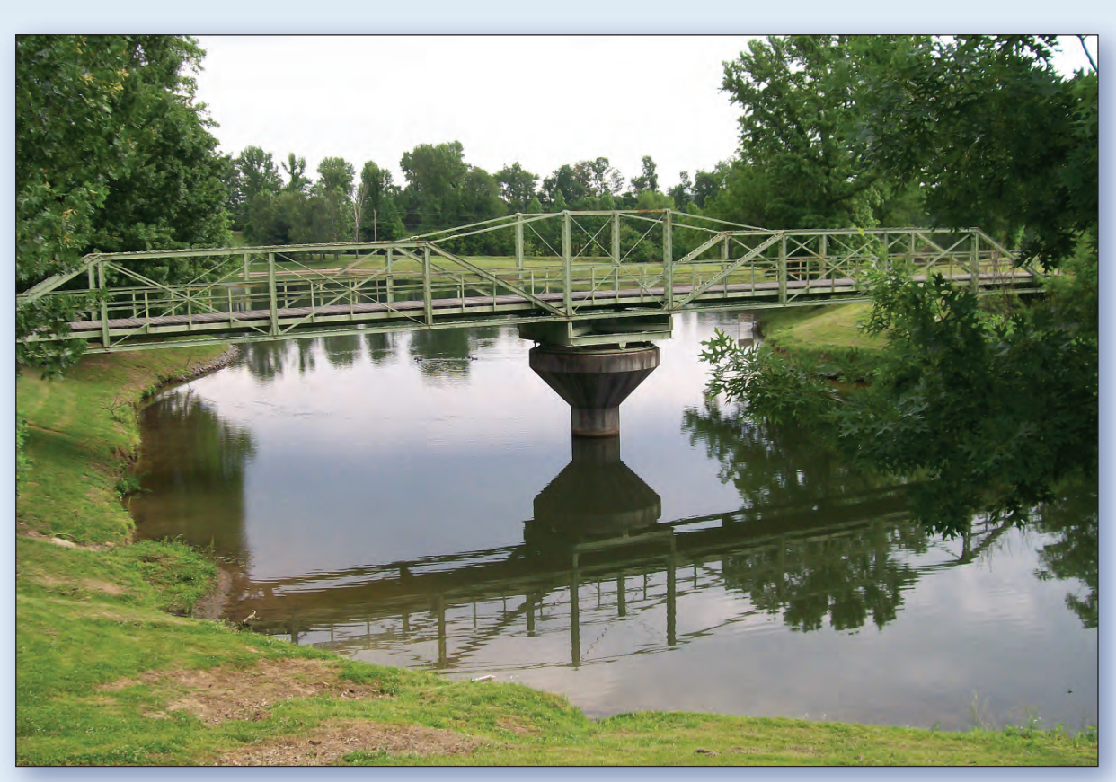
THE LENOX BRIDGE: The Vincennes Bridge Company erected this pin-connected Pratt pony swing span in 1916 in rural Dyer County. Barricaded in 1973, the bridge continued to deteriorate and partially collapsed in 1977 when a tractor trailer loaded with farm tractors became lost and attempted to cross it. Left as a ruin, its future was uncertain until the 1980s, when as part of a dredging project, the U.S. Army Corps of Engineers relocated this span to its current site northwest of Dyersburg for pedestrian use in a subdivision. Dedication ceremonies were held on June 27, 1988.