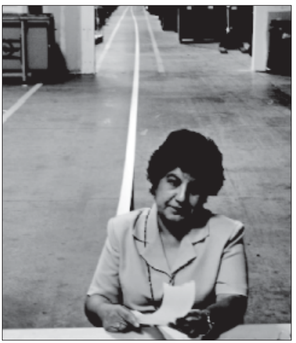
Figure 3.

precinct where the pilot program was tested used the same system as the state of Nevada. Only 270 of the 1,495 voters in the precinct used it to cast their ballots. A joint report by the San Bernardino County Registrar of Voters and Sequoia Voting Systems characterized voters' comments about their experiences as positive; however, the manual recount that followed as part of the pilot was not.