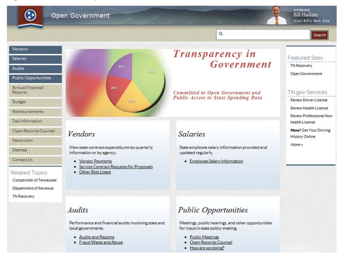
Figure 1. Tennessee's Open Government Website