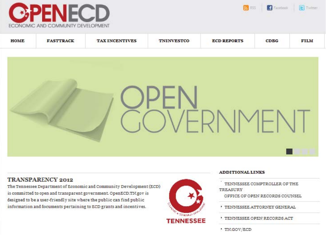
Figure 2. Tennessee's OPENECD Website