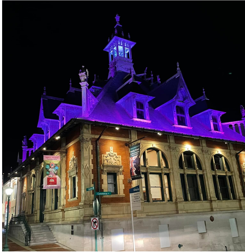
The Customs House Museum, Clarksville, Tennessee was Purple on April 20, 2022 for MIC3 National Purple Up Day!