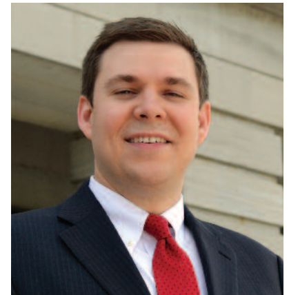
The Legislative Summary was prepared by Kurt Hippel, TDMHSAS Office of Legislation and Rules.

Read the 2015 TDMHSAS Legislative Summary in its entirety.