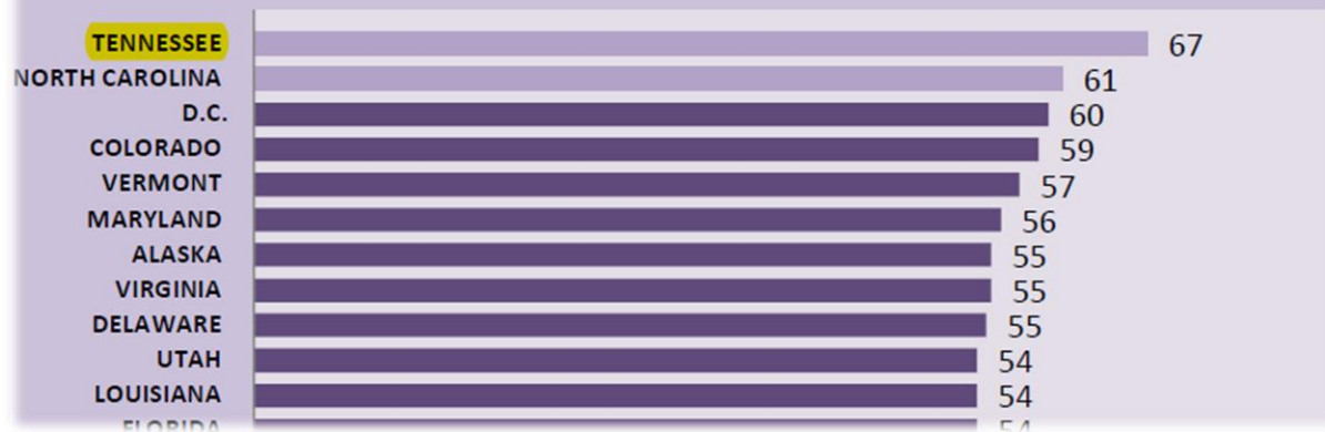
COPR Scores: 2018 Status (Highest to Lowest) (States with 2018 changes in lighter color)

Tennessee's licensing regulations are currently the most supportive of obesity prevention and HWRPs in the nation!