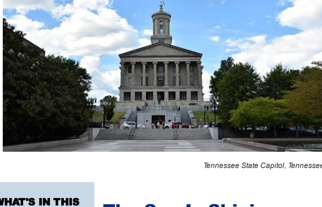
Tennessee State Capitol, Tennessee