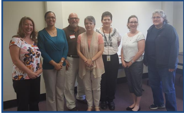
TBI ADVISORY COUNCIL MEMBERS

The duties of the Advisory Council are to advise the TBI coordinator, make recommendations and perform other duties as necessary for the implementation of a state-wide plan to assist TBI persons and their families. The Advisory Council is composed of individuals dedicated to improving the lives of TBI survivors in Tennessee. Their advice and recommendations have been invaluable to the development of the TBI program. The TBI Advisory Council is currently investigating options to utilize available resources in the TBI trust fund for the benefit of TBI survivors.