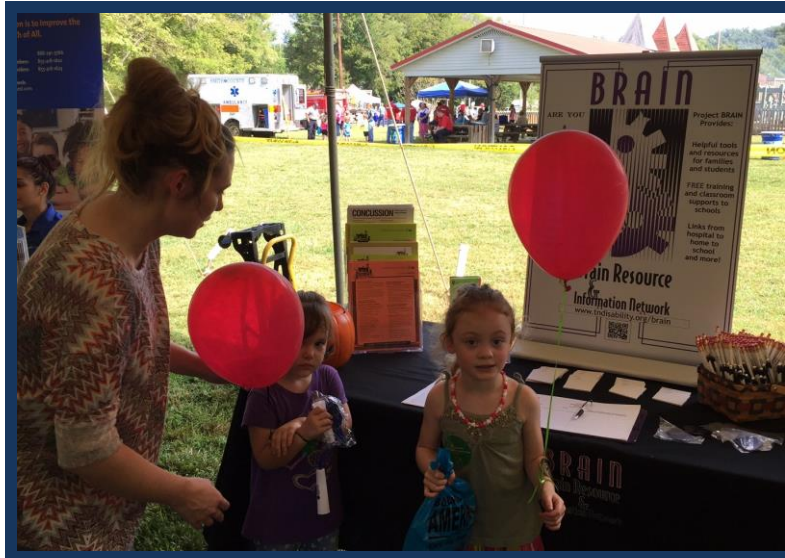
PROJECT BRAIN AT KIDS CENTRAL EVENT