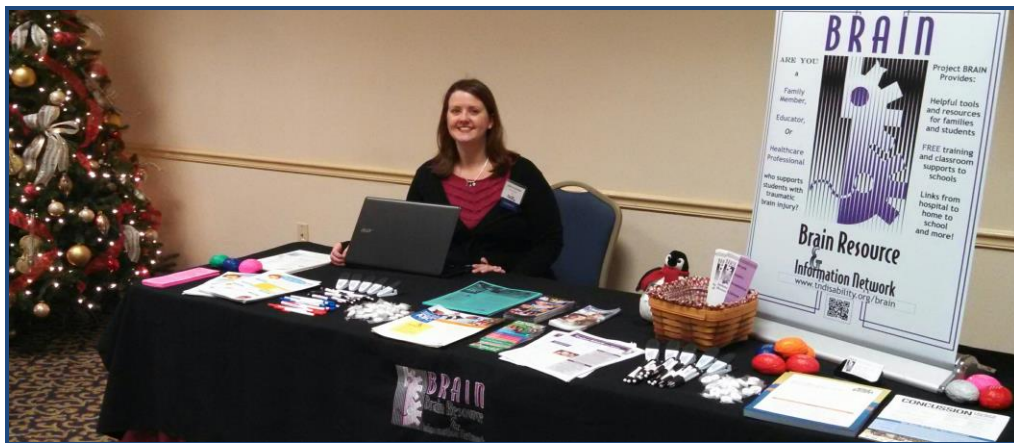
PROJECT BRAIN STAFF AT CONFERENCE

Project BRAIN seeks to link hospital and community health providers with school professionals for identifying and addressing the needs of students with brain injuries. A specially designed TBI curriculum, Brain Injury 101 , is used to train educators, health professionals and families. Project BRAIN provides training in any school system in the state upon request.