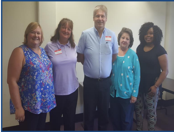
TBI SERVICE COORDINATORS

The TBI service coordinators and the Project BRAIN staff work closely to serve survivors and families. In October 2015, the TBI service coordinators and the Project BRAIN staff attended a training retreat to provide them the opportunity to share resources, participate in team building and to discuss issues of common ground.