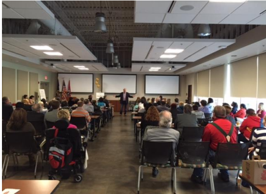
FAMILY DAY CONFERENCE 2016

attend formal or informal education programs through colleges, workshops, seminars, or conferences;