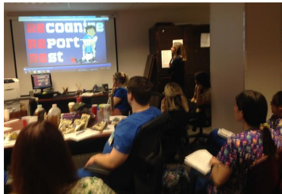
ERLANGER BITL TRAINING HOSPITAL STAFF

A BITL follows up with families after they leave the hospital emergency department if their child has been treated for TBI. When families consent to receive follow up calls, they also potentially receive support from the Department of Education. During FY15, the BITLs served over 1,500 families.