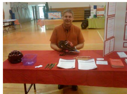
SERVICE COORDINATOR PREVENTION EXHIBIT

The development of the state registry and the resulting availability of statistics are directed toward encouraging research on the causes, effects and treatment of brain trauma injuries. The collection of all types of information on TBI through the clearinghouse will further identify areas for research development. Education and injury prevention activities for health care providers and the public, provide baseline data for pursuing further investigations.