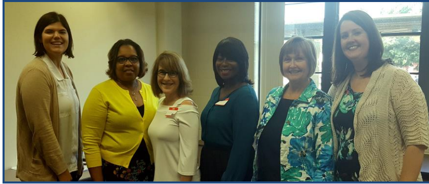
PROJECT BRAIN STAFF

Expansion of services: The expansion of services for TBI survivors is accomplished through the grants program as outlined in Section 68-55-402 below. Program staff collaborates with the Tennessee Disability Coalition, the Brain injury Association of Tennessee, the Epilepsy Foundation, and other relevant agencies to improve services for all persons with disabilities in the state.