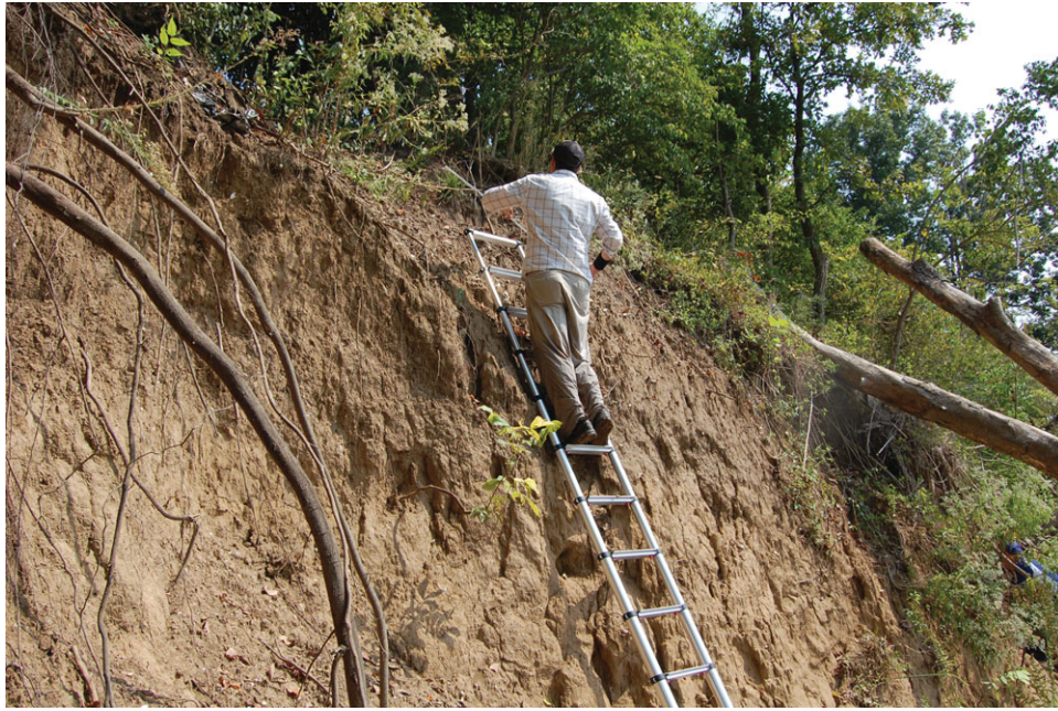
FIGURE 3. Archaeological inspection of intact deposits exposed along the eroded riverbank profile in July 2010 prior to sampling.

photographed and documented but not removed, in consultation with the state archaeologist and according to the requirements of Tennessee burial laws.