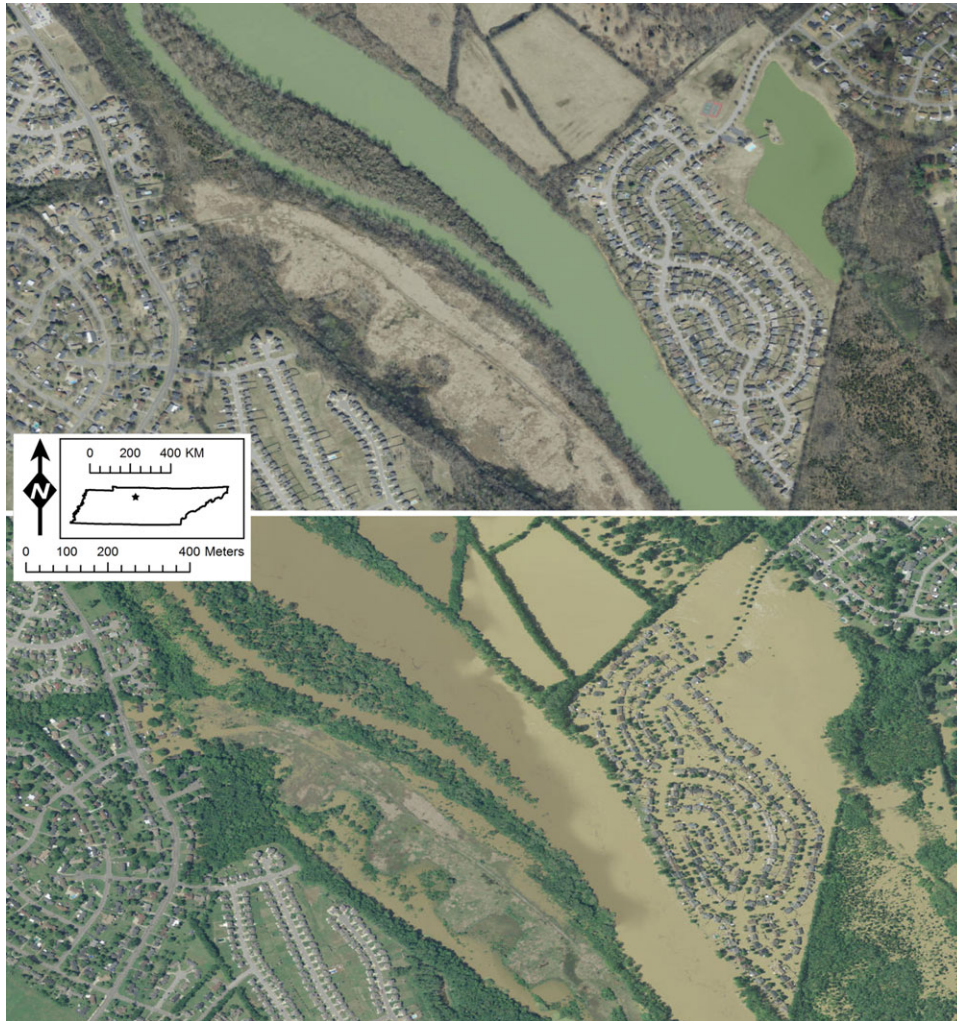
FIGURE 1. Aerial imagery of the Cumberland River near Nashville, showing the extent of the 2010 flood. (Top) February 27, 2010; (Bottom) May 3, 2010. Orthophoto images courtesy of Metro Nashville Government and Kucera International Inc. ( http://maps.nashville.gov/arcgis/rest/services/Imagery/2010Imagery_WGS84/MapServer ; http://maps.nashville.gov/arcgis/rest/services/Imagery/May2010_FloodImagery_WGS84/MapServer )

relocate all recorded site locations. Site data from the state site files were augmented wherever possible via direct communication with landowners and avocational archaeologists, who shared personal finds and anecdotal information. Under our direction, volunteers including students from MTSU, avocational archaeologists, and members of the Nashville community then conducted visual assessments of the shore and bank line for the entire project area as well as at specific locations of previously recorded sites. These inspections were designed to estimate the extent of both natural and anthropogenic impacts, and to evaluate the integrity of any exposed deposits. Horizontal site boundaries were determined based on the extent of bank line deposits and recorded with handheld GPS equipment. GPS data were also used to record the location of looting activity. Site locations, any in situ deposits, natural or cultural disturbances, and displaced human remains were documented using digital camera equipment and recorded using standardized damage assessment forms based on those developed by the National