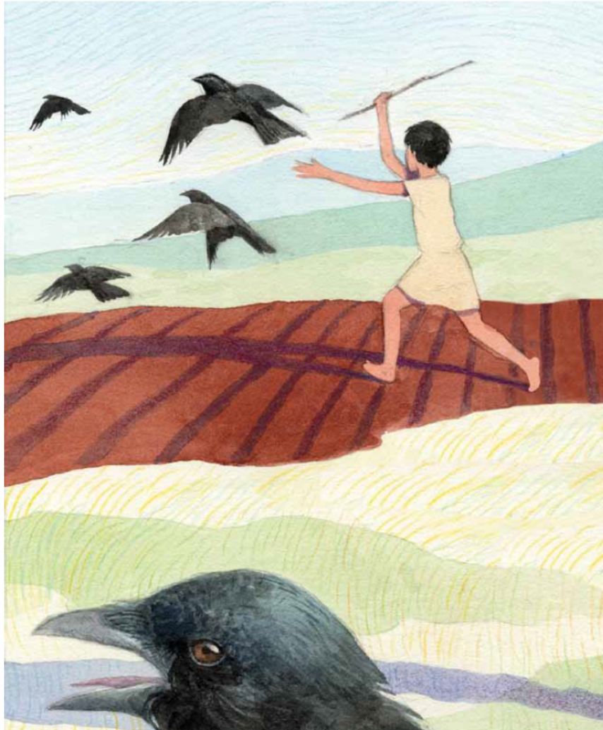
Awan continues to guard the corn crop.