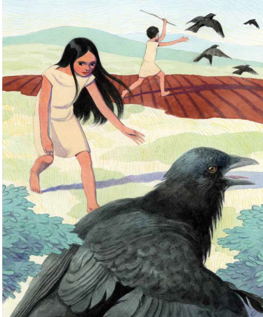
Awan scares crows away while Adoette notices a hurt crow.