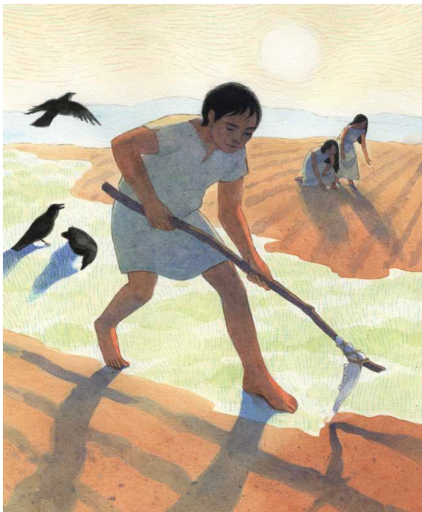
People working to plant corn seeds