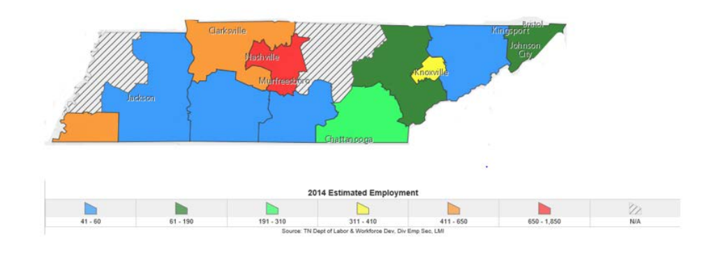
Figure 3. 2014 Estimated Employment<sup>16</sup>

Job opportunities for STEM occupations, limited to the above three professions listed above, are strongest in urban and surrounding areas in Tennessee. Figure 3 shows that more STEM occupations in Tennessee are employed and needed in the Memphis, Nashville, and Chattanooga areas than in surrounding areas.