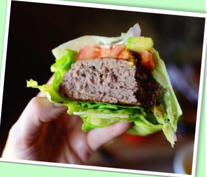
Tips adapted from diabeticlivingonline.com.

Use large lettuce leaves, such as romaine or Bibb, to make your sandwiches instead of bread. This will also help you to reduce your carb intake.